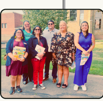
STAFF ATTENDED THE ST. BENEDICT CARE AND THE EAST MIGRANT PROGRAM IN ERIE. THE PROGRAM PROVIDES EDUCATION AND SERVICES TO MIGRANT FAMILIES WHO WORK IN THE AGRICULTURAL SECTOR IN PA.