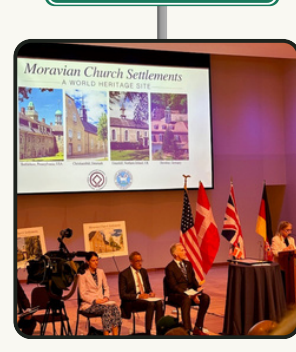
STAFF ATTENDED THE CEREMONY RECOGNIZING THE MORAVIAN CHURCH SETTLEMENT BUILDINGS IN BETHLEHEM AS A UNESCO WORLD HERITAGE SITE.