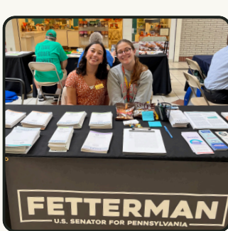
CONSTITUENT SERVICES HOSTED A BOOTH AT THE WASHINGTON COUNTY SENIOR FAIR.