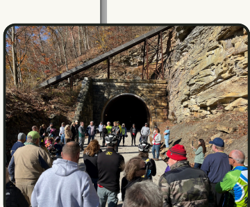
STAFF ATTENDED THE OPENING OF THE BRADY BIKE AND PEDESTRIAN TUNNEL. THE RAILROAD TUNNEL WAS BUILT IN 1915 ALONG THE ARMSTRONG TRAIL.