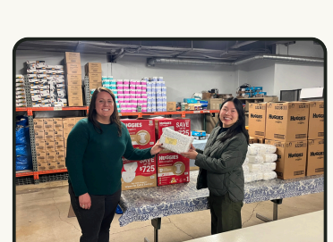
STAFF VOLUNTEERED AT THE WESTERN PENNSYLVANIA DIAPER BANK AND HELPED TO PACK DIAPERS FOR THE COMMUNITY.