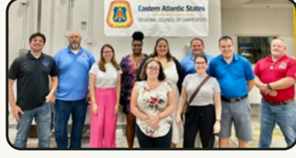
THE ENTIRE EASTERN REGION TEAM FOR SENATOR FETTERMAN PLUS OTHER STAFF TOURED THE EASTERN ATLANTIC STATES REGIONAL COUNCIL OF CARPENTERS TRAINING FACILITY IN ALLENTOWN.