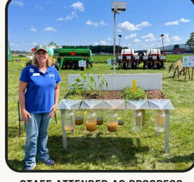
STAFF ATTENDED AG PROGRESS DAYS IN CENTRE COUNTY TO LEARN ABOUT SOIL CONSERVATION.