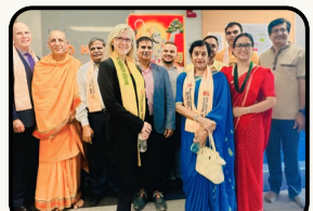
STAFF ATTENDED THE BHUTANESE VEDIC CONVOCATION IN HARRISBURG. THEY MEET WITH 80 GRADUATES FROM ALL OVER THE USA AND CANADA.