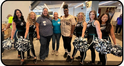
THE PHILLY TEAM VOLUNTEERED AT THE CRADLES TO CRAYONS BACKPACK-A-THON WITH THE EAGLES CHEERLEADERS! THEY HELPED PACK 35,000 BACKPACKS FOR CHILDREN IN THE AREA.