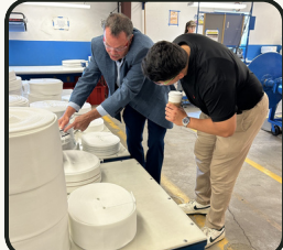
STAFF TOURED SNAP-TITE HOSE, INC. IN FAIRVIEW. SNAP-TITE IS A LEADER IN MUNICIPAL FIRE ASSEMBLIES & MILITARY HOSE ASSEMBLIES.