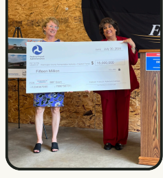
FREEDOM TRANSIT IN WASHINGTON COUNTY RECEIVED $15 MILLION FROM THE FEDERAL TRANSIT ADMIN. FOR A NEW BUS STORAGE AND MAINTENANCE FACILITY.